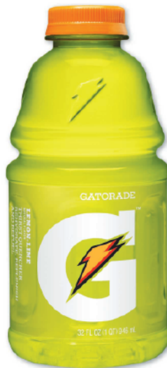
64 oz. Gatorade