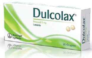
5 mg Tablets Dulcolax