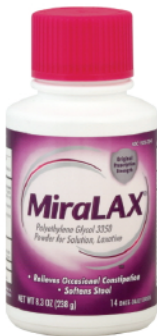
8.3 oz. Miralax