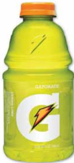
64 oz. Gatorade