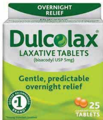
(4) 5 mg Dulcolax Tablets

DO NOT EAT OR DRINK ANYTHING AFTER MIDNIGHT; AVOID CHEWING TOBACCO, CHEWING GUM OR EATING CANDY TWO HOURS BEFORE PROCEDURE. It is extremely important to have no food or liquid in your mouth or stomach prior to procedure in order to avoid aspiration pneumonia risk due to the sedatives.