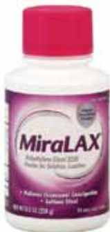
8.3 oz. Miralax