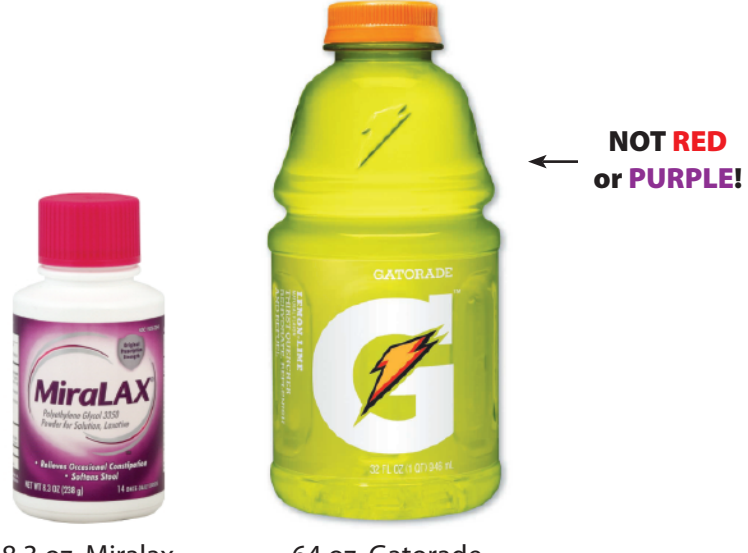
8.3 oz. Miralax

4. AT 4:00 PM MIX ENTIRE 8.3 OZ BOTTLE OF MIRALAX INTO THE 64 OZ BOTTLE OF GATORADE UNTIL IT COMPLETELY DISSOLVES.